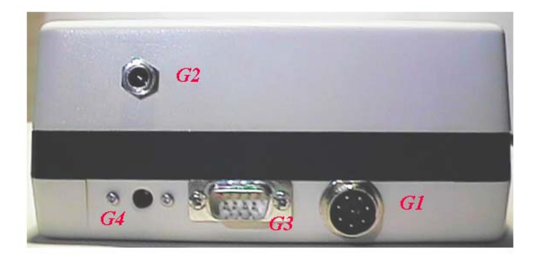
Fig. 3. Back panel of MEB-2c: G1 – probe input; G2 – charger input 1; G3 – RS232 output; G4 - charger input 2.

Fig. 2. Front panel of MEB-2c: W1 – power switch (MAIN); W2 – back light switch (BL); LCD - screen; P4 – switch INFO; P5 – switch UR ON; P6 - switch UR OFF; P1, P2 – gain switches G [dB]); P3 – threshold voltage switch.